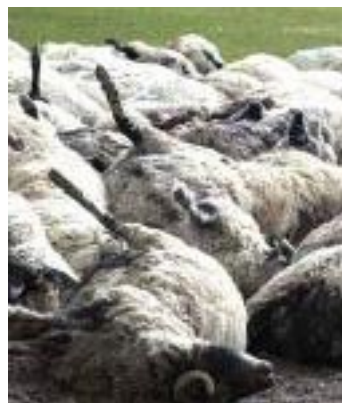
Image 3: After the slaughter