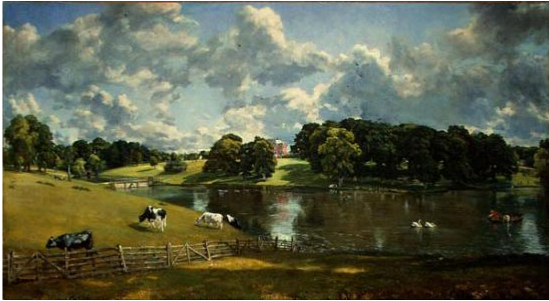
John Constable: "Wivenhoe Park, Essex" (1816)