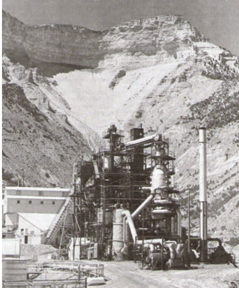
Fig. 5. The Paraho 250 t/d Semiworks Plant in Colorado, ca. 1979

commercial scale, it has been used in extended operations, with oil shales from several countries, for more than 30 years. A detailed engineering design study was completed for the retorting section of a commercial plant that would use the technology. A preliminary design for a commercial mine and the balance of the processing plant was completed. These are important steps towards preparing the technology for commercial application. However, the project remained on paper.