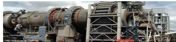
Fig. 4. 210 ton per hour Alberta Taciuk Process (ATP) Retort

The ATP was first used in 1989 to clean contaminated soils. Its first, and, so far, only use in the mining industry was in the Stuart oil shale project at Queensland, Australia – see Fig. 4. Stuart was developed by Suncor, the Canadian tar sands firm, and Southern Pacific Petroleum (SPP), an Australian firm. Stuart's single ATP retort was designed to produce 4500 bbl/d of shale oil from 6000 t/d of oil shale. Commissioning began in July 1999. There were problems with the retort and other equipment, especially the oil shale dryer. Although operations were difficult throughout the life of the Stuart project, by the end of 2003 the plant had run for more than 500 days (up to 96 days without stopping) and produced more than 1.3 million barrels. Production rates reached about 82% of the nominal capacity, and oil recovery ratio touched 94% of targeted design [25]. The high quality oil was sold as feed to refineries and as heating oil.