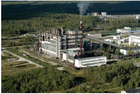
Fig. 3. Oil shale plant at Narva, Estonia

demand, and 200 thousand t/yr of oil shale is used in cement industry – see Fig. 3 - [18-20].