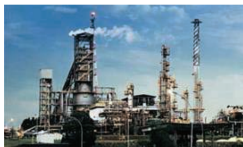
Fig. 2. Petrosix Complex in Brazil

The Petrosix process was developed by Petrobras, the national oil company of Brazil, beginning in 1956. The intent was to exploit the huge Irati oil shale deposits and thereby reduce Brazil's absolute dependency on imported petroleum. Today Brazil produces most of its liquid fuels from offshore oil wells, ethanol plants, and its two Petrosix retorts. The Petrosix process heats coarse oil shale in a vertical cylindrical vessel. Oil shale enters through the top and is heated with reheated recycled gases as it moves down, and is discharged from the bottom. Oil vapors and gases are discharged through the top. Part of the gas is burned to heat the other part, which is returned to the vessel to heat the oil shale. Oil recoveries are high and produced shale oil quality is good – see Fig. 2. Fine oil shale and the solid pyrolysis product are currently discarded, but they could be exploited in other projects [15, 16].