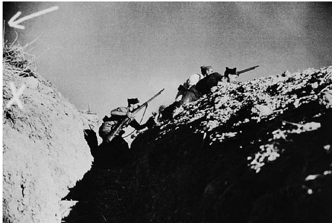
The arrow points to approximately where Borrell must have been standing when he was shot. The cross indicates where Capa was evidently hugging the side of the gully.