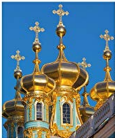
The guides that show you what others only tell you

Preview and Read By DK Dk Eyewitness Travel Guide St Petersburg , the best book and very sought after book, This Book/PDF in the market store is sold at prices but here you can read for free and you can also read all of our latest book collections. Which certainly updates every day.