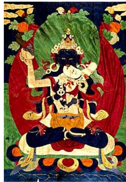
Figure 7: Tibetan Yab-Yum, 18th Century.

figures in many of the scenes was an indication of the ritualized enactments of the sexual act inside the temple, and the impossible postures of many of the figures symbolized the divinity of the sexual partners. As described above, in the Tantric tradition, experienced practitioners could experience godhood through the sexual act; indeed, the practitioners were held to become gods during the course of the ritual. This union is symbolized by the Tibetan yab-yum, in which two gods are shown in ecstatic embrace, their limbs so intertwined that one cannot tell which is which [Figure 7].