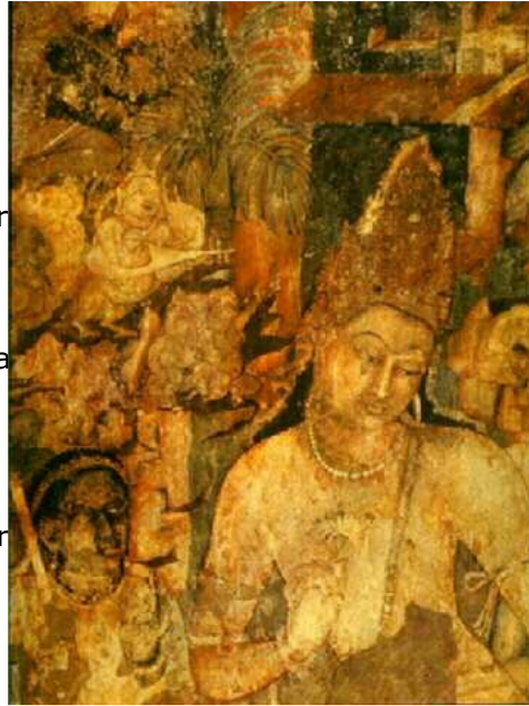
Figure 9: Bodhisattva Padmapani. Ajanta, 5th century A.D.

India into China, it took its iconography along with it. Buddha are found along the northern trade routes dating to the fourth century A.D. Typical was