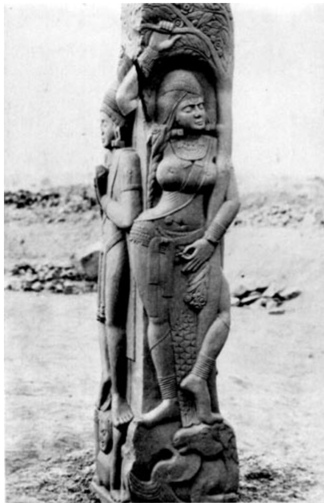
Figure 4: Yakshi Chandra. Bharhut stupa, Shunga, 2nd century B.C.

ritual sex to channel energy into the search for enlightenment. This sect was known as Tantric Hinduism, and practitioners worshipped Shiva and his consort, Shakti.