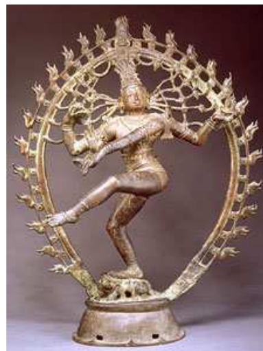
Figure 3: Shiva Nataraja. Chola, A.D. 11th–12th century A.D.