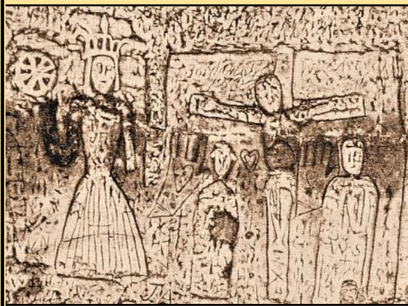
Royston Caves carvings linked to rites of symbolic Death and Rebirth

Our view of ancient cultures and successive religions may well be influenced by these discoveries and their implications. Ancient hillforts, stone circles, holy wells, tumuli and earthworks are found at significant centres once used by those of earlier times for the benefits and revelations bestowed by Nature. Neglected shrines such as Royston Cave, a subterranean cavern covered in strange carvings, show that religious and esoteric rites were once performed to invoke the earth's vital energy. This force has the potential to