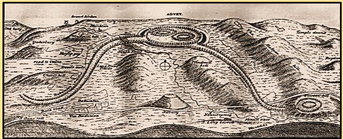
William Stukeley's drawing of the Serpent Temple of Avebury

This alignment, or ley line, connects legendary places such as St Michael's Mount, Glastonbury, Avebury, Bury St Edmunds and many others whose significance is half-forgotten. Marking special places along the line are a great number of churches, some important, others almost secret, which are often dedicated to St Michael and other dragon-slaying saints, or to St Mary, the Christianised earth goddess.