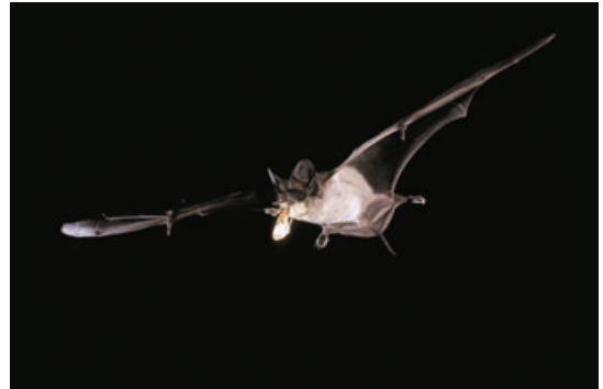
Figure 1. Brazilian free-tailed bat ( Tadarida brasiliensis ) flying with a moth in its mouth (photo by Merlin D. Tuttle, Bat Conservation International, www.batcon.org ).

Among the estimated 1,232 extant bat species, 8 over two thirds are either obligate or facultative insectivores (Table 1). They include species that glean insects from vegetation and water in cluttered forests to those that feed in open space above forests, grasslands, and agricultural landscapes (Fig. 1). Although popular literature commonly recognizes bats for their voracious appetites for nocturnal and crepuscular insects, 35 the degree to which they play a role in herbivorous arthropod suppression is not well documented. In this section, we review the available literature on the predator–prey interactions between