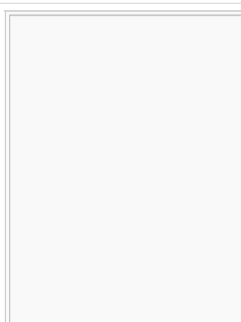
Peanuts characters featured on the cover of the April 9, 1965 issue of TIME magazine .

Considered amongst the greatest comic strips of all time, Peanuts was declared second in a list of the greatest comics of the 20th century commissioned by The Comics Journal in 1999. [13] Peanuts lost out to George Herriman 's Krazy Kat , a strip Schulz admired, and he accepted the positioning in good grace, to the point of agreeing with the result. [14] In 2002 TV Guide declared Snoopy and Charlie Brown equal 8th [15] in their list of "Top 50 Greatest Cartoon Characters of All Time", [16] published to commemorate their 50th anniversary.