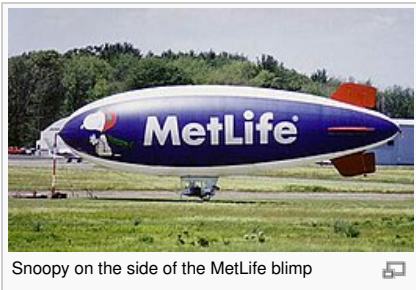
Snoopy on the side of the MetLife blimp

Over the years, the Peanuts characters have appeared in ads for Dolly Madison snack cakes, Chex Mix , Bounty , Cheerios , A&W Root Beer , Kraft Foods , and Ford automobiles. [22][23] Pig-Pen appeared in a memorable spot for Regina vacuum cleaners . [24]