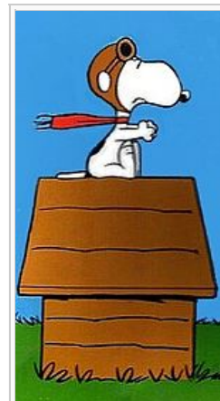
Snoopy as "the World War I flying ace", flying his Sopwith Camel .

Schulz also added some fantastic elements, sometimes imbuing inanimate objects with sparks of life. Charlie Brown's nemesis, the Kite-Eating Tree, is one example. Sally Brown's school building, that expressed thoughts and feelings