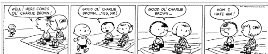
The first strip from October 2, 1950 .