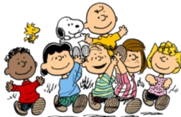
The Peanuts gang Top row: Woodstock , Snoopy , and Charlie Brown Bottom row: Franklin , Lucy van Pelt , Linus van Pelt , Peppermint Patty , and Sally Brown