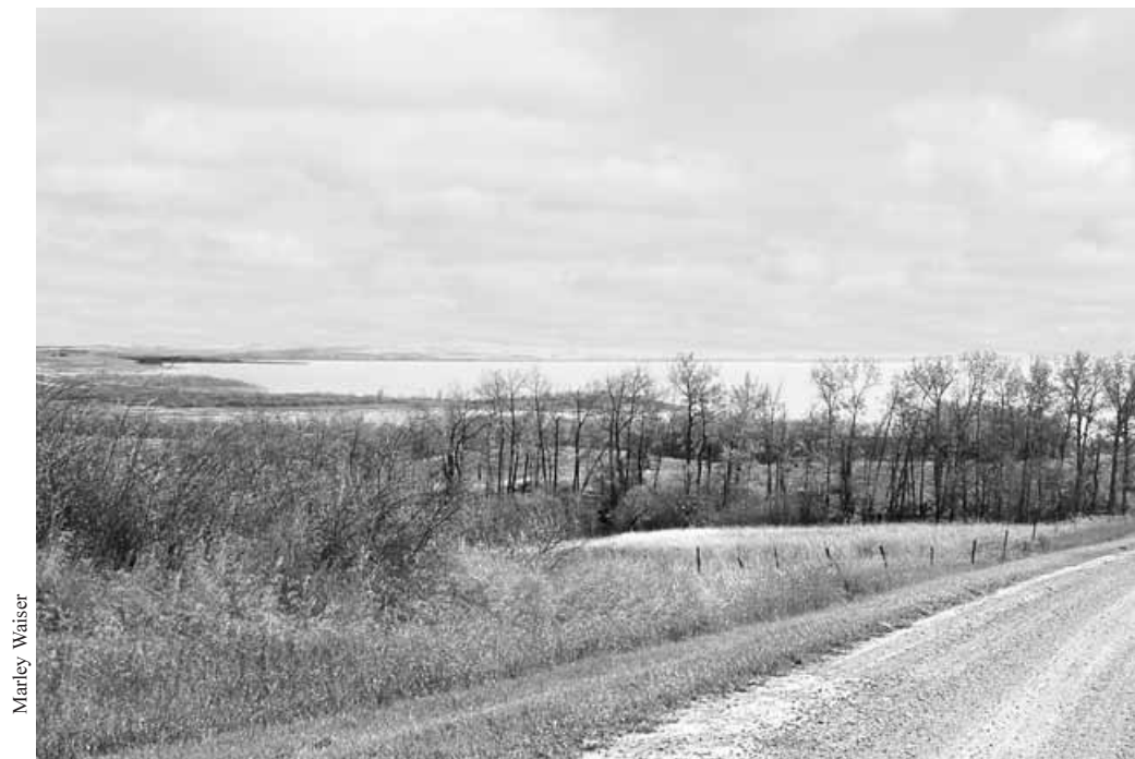
Approaching Redberry Lake, Saskatchewan, Canada

The International Association of Theoretical and Applied Limnology works worldwide, to understand lakes, rivers and wetlands and to use knowledge, gained from research, to manage and protect these diverse, inland aquatic ecosystems.