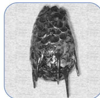
Euglypha acanthophora - wall vase