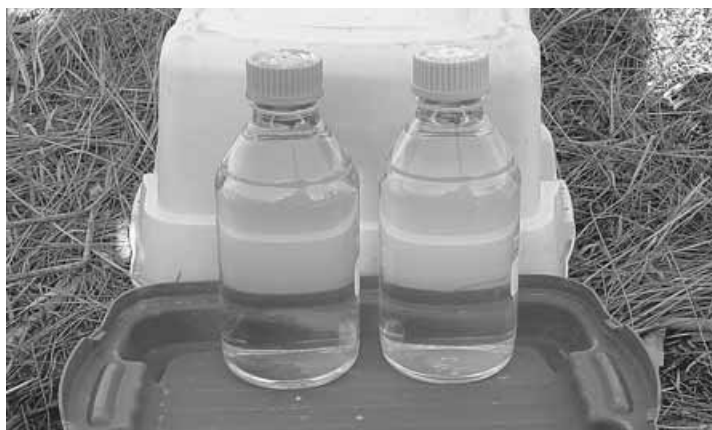
Photograph of coloured Oscar Creek water (left) and clear, non-coloured Redberry Lake water.

UV-R to a far less extent than DOC in either Oscar Creek or other prairie systems having similar DOC concentration (Fig. 1; Waiser and Robarts 2000). Combining Redberry data with that from other saline systems, it was found that slopes of UV-A and UV-B versus DOC were significantly less than freshwater relationships (Arts et al. 2000). The fact that UV light penetrated much deeper into saline systems than freshwater counterparts was related to DOC composition. A Redberry Lake study which compared source DOC (from Oscar Creek) to lake DOC revealed that lake DOC had higher C:N ratios, was lower in molecular weight, chromophoric constituents and aromaticity and was older than source DOC (Fig. 2). DOC entering the lake was essentially 'trapped' in the endorheic basin. Over many years, coloured DOC, originating from Oscar Creek lost more than half of its aromaticity due to photodegradation. Low aromaticity and chromophoric constituents accounted for the high penetration of UV light in Redberry Lake (Waiser and Robarts 2000).