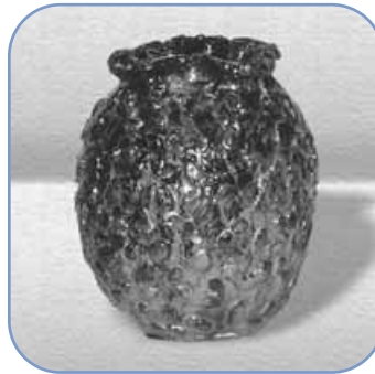
Diffugia bravicolla - table vase