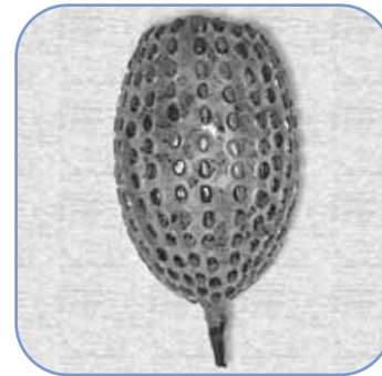
Phacus sp. - wall vase

Hakumat Rai Heikendorf, Germany HRai@gmx.de