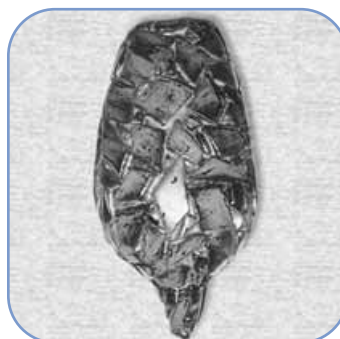
Diffugia acuminata - wall vase

I taught myself ceramic art by reading books on contemporary ceramics and observing ceramic artists shaping their work at exhibits in different countries. I examine nature closely, with an imaginative, scientific and curious eye, seeking to duplicate that which I observe. My art is a reciprocal process, linking art to nature and nature to art. I see natural forms when examining micro-organisms and the underlining structural order that produces each individual form. The characteristics of my art are determined by my conception of what I see and by what I feel constitutes nature. My view of nature is an ordered and rational one; my forms are harmonious and rhythmic with an emphasis on the whole rather than on the parts. My work is neither manufactured nor natural; it is sculpture that achieves beauty by capturing the essential nature and design of the real microbial world.