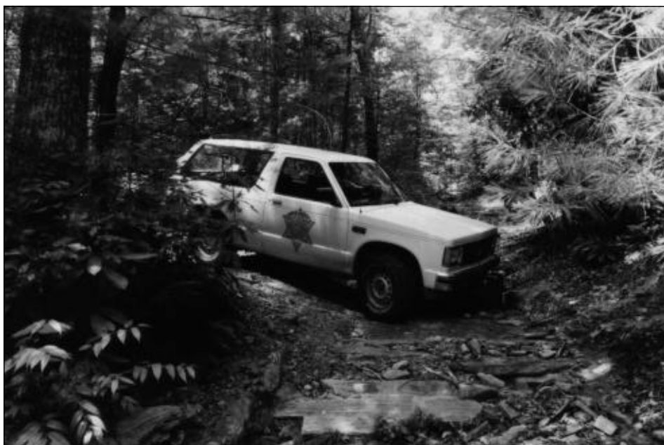
Officer encounters adverse physical conditions in isolated area.

Economic factors. High rates of poverty have long been associated with high rates of crime. Crime has been less frequent in rural areas, although poverty has been a common problem in rural America. For example, of the 159 high-poverty counties in the United States in 1979, only six contained a city with a population of 25,000 or more. 43 Further,