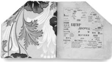
Fig. 9. DAVID BURLIUK, VLADIMIR BURLIUK, AND VASILII KAMENSKII. Tango with Cows: Ferro-concrete Poems by Vasilii Kamenskii. 1914. Letterpress on wallpaper by Kamenskii, 7 7 / 16 x 7 9 / 16 " (18.9 x 19.2 cm). Ed.: 300. The Museum of Modern Art, New York. Gift of The Judith Rothschild Foundation