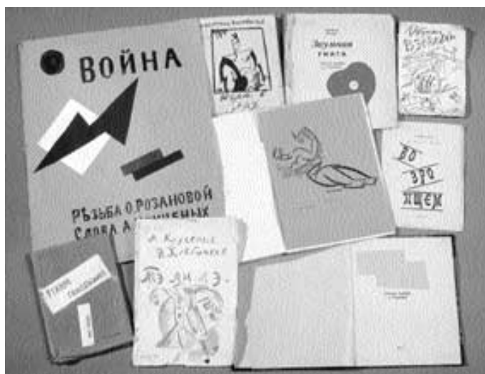
Fig. 8. Russian Futurist books by OLGA ROZANOVA . 1913–16

Alexander Benois, who sarcastically called the first Futurist books “buffoonish little albums,” was actu-