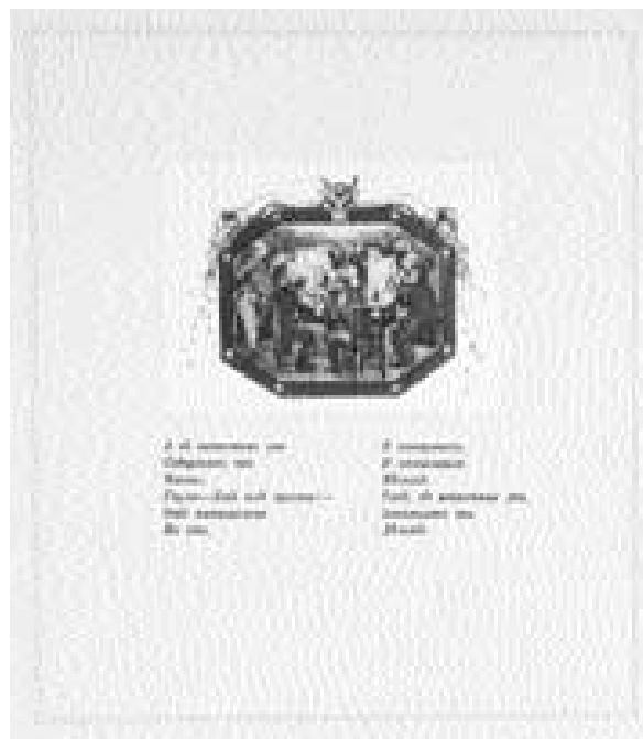
Fig. 7. ALEXANDER BENOIS Queen of Spades by Aleksandr Pushkin. Letterpress, 11 5/8 x 9" (29.5 x 22.9 cm). St. Petersburg: R. Golike and A. Vil'borg, 1911

In a sense, Russian Futurists were anarchists in their art, but anarchists throwing books as if they were bombs. They saw themselves engaged in the radical liberation of the human spirit. As realized in Futurist books, this anarchic anti-canoncity of the early Russian avant-garde was not so much an attempt just to épater le bourgeois , but a method of cognition, or new epistemo-