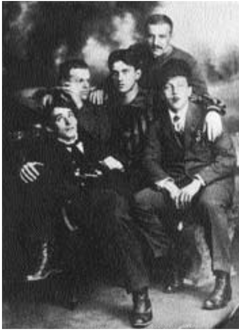
Fig. 2. Aleksei Kruchenykh, David Burliuk, Vladimir Mayakovsky, Nikolai Burliuk, and Benedikt Livshits. 1913.