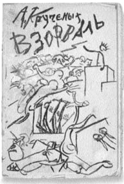
Fig. 5. NATAN AL'TMAN, NATALIA GONCHAROVA, NIKOLAI KUL'BIN, KAZIMIR MALEVICH, AND OLGA ROZANOVA. Explodity by Aleksei Kruchenykh. 1913. Lithographed cover by Kul'bin, 6 \frac{7}{8} x 4 \frac{5}{8} " (17.5 x 11.8 cm). Ed.: 350. The Museum of Modern Art, New York. Gift of The Judith Rothschild Foundation