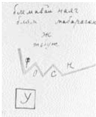
Fig. 6. OLGA ROZANOVA AND ALEKSEI KRUCHENYKH. Visual Poetry . 1916. India ink and watercolor, 3 \frac{3}{8} x 2 \frac{15}{16} " (8.6 x 7 cm).

fact, a real object, which takes the shape of a book. To name something is an intentional act of creation that in Futurist poetics becomes a “magical” act. As Kruchenykh proclaimed in “Declaration of the Word as Such”: “The artist has seen the world in a new way and, like Adam, proceeds to give things his own names.” 18 In this respect the avant-gardists are rather like savages who know how to invoke, worship, and play with objects. For them, to name or to draw something means to possess and control it and create it anew.