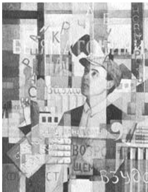
Fig. 1. IVAN KLIUN. Kruchenykh and his Books . 1920s. Watercolor and paper.

The means for disseminating words are books.