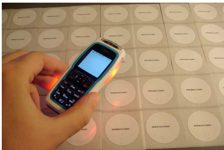
Figure 2: Nokia 3220 phone. Source: Courtesy of Timo Arnall 1