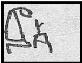
Figure 1. The ancient Chinese character: Death

Based on the above observation, we began to study people’s drawings of their personal conception of their own death. Study on death images or metaphors is not new in thanatological literature. Ross & Pollio (1991) proposed that death metaphors may relay death concepts that are difficult to convey by spoken languages and that can better reveal