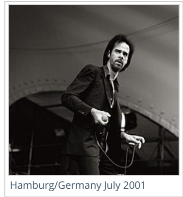
Hamburg/Germany July 2001

In September 2013 interview, Cave explained that he returned to using a typewriter for songwriting after his experience with the Nocturama album, as he "could walk in on a bad day and hit 'delete' and that was the end of it". Cave believes that he lost valuable work due to a "bad day". [12]