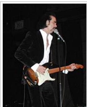
Nick Cave at a solo concert in Mainz, Germany on 11 November 2006.

Cave played with Shane MacGowan on cover versions of Bob Dylan 's "Death is Not the End" and Louis Armstrong 's "What a Wonderful World". Cave also performed "What a Wonderful World" live with the Flaming Lips . Cave recorded a cover version of the Pogues song "Rainy Night in Soho", written by MacGowan.