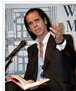
Cave reading from The Death of Bunny Munro in New York City, 2009.

Cave's first film appearance was in Wim Wenders' 1987 film Wings of Desire , in which he and the Bad Seeds are shown performing at a concert in Berlin.