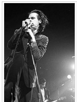
Cave performing in

Reviewing 2008's Dig, Lazarus, Dig!!! album, NME used the phrase " gothic psycho-sexual apocalypse" to