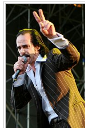
Cave performing in 2008