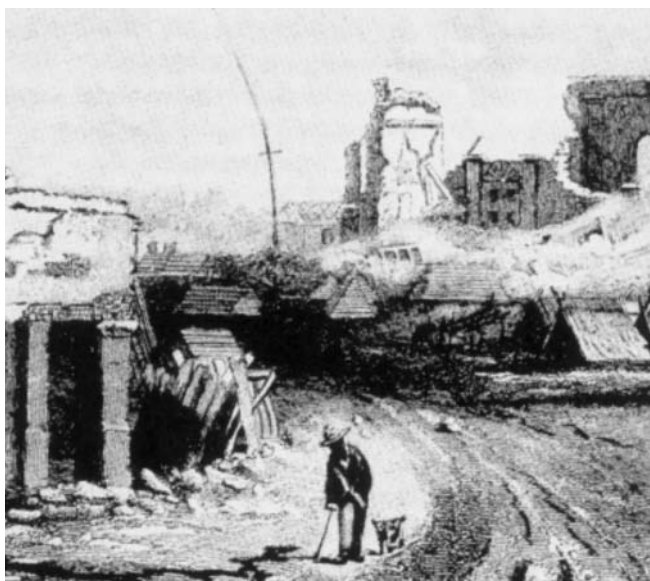
Figure 5 Conception after the earthquake of 1835 (Illustration from Darwin, 1986)

Alison had described a most violent tsunami destroying several towns along the coast, which might well be blamed for other alterations on the shore. “Large fissures are stated to have been made in