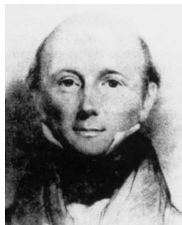
Figure 4 George Bellas Greenough in the 1830s. (Portrait from Rudwick 1985, fig. 4.2.)

More than three years elapsed before George Bellas Greenough (Figure 4), then president of the Geological Society of London, took up the issue in 1834, and launched a public attack on Maria Graham, denying the elevation of land by earthquakes. In a rhetorically brilliant address to the Geological Society (Greenough, 1834), he tried to undermine Graham's credibility by means of selective quotation,