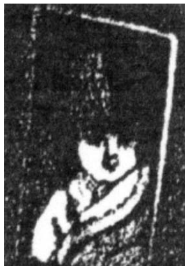
Figure 1 Probably a self-portrait of Maria Graham. Strongly enlarged detail from the frontispiece of Graham (1824).

In 1823, she travelled back via Brazil to England, where she published books on Brazil and Chile. A few months later she was again back in Brazil as governess to Donna Maria, daughter of the Prince of Portugal and Emperor of Brazil.