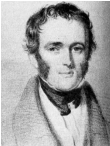
Figure 3 Charles Lyell in 1836. (Portrait from Rudwick 1985, fig. 4.6.)

land, although its place on the shore had not been shifted. The alteration of level at Valparaiso was about three feet, and some rocks were thus newly exposed, on which the fishermen collected scallop shell-fish, which was not known to exist there before the earthquake. At Quintero, the elevation was about four feet. When I went to examine the coast... although it was high water, I found the ancient bed of the sea laid bare and dry, with beds of oysters, mussels, and other shells adhering to the rocks on which they grew, the fish being all dead and exhaling most offensive effluvia." (Graham, 1823)