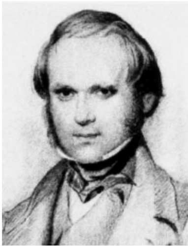
Figure 6 Charles Darwin around 1837.

ever, that since we have ascertained the fact of a rise of three, five, and even ten feet in parts of the same country in 1835, so distinctly attested by Captain FitzRoy, all doubts entertained as to the permanent effects of a preceding convulsion are comparatively of small interest." (Lyell, 1837, p. 505) With these words, he dismissed Maria Graham from further arguments.